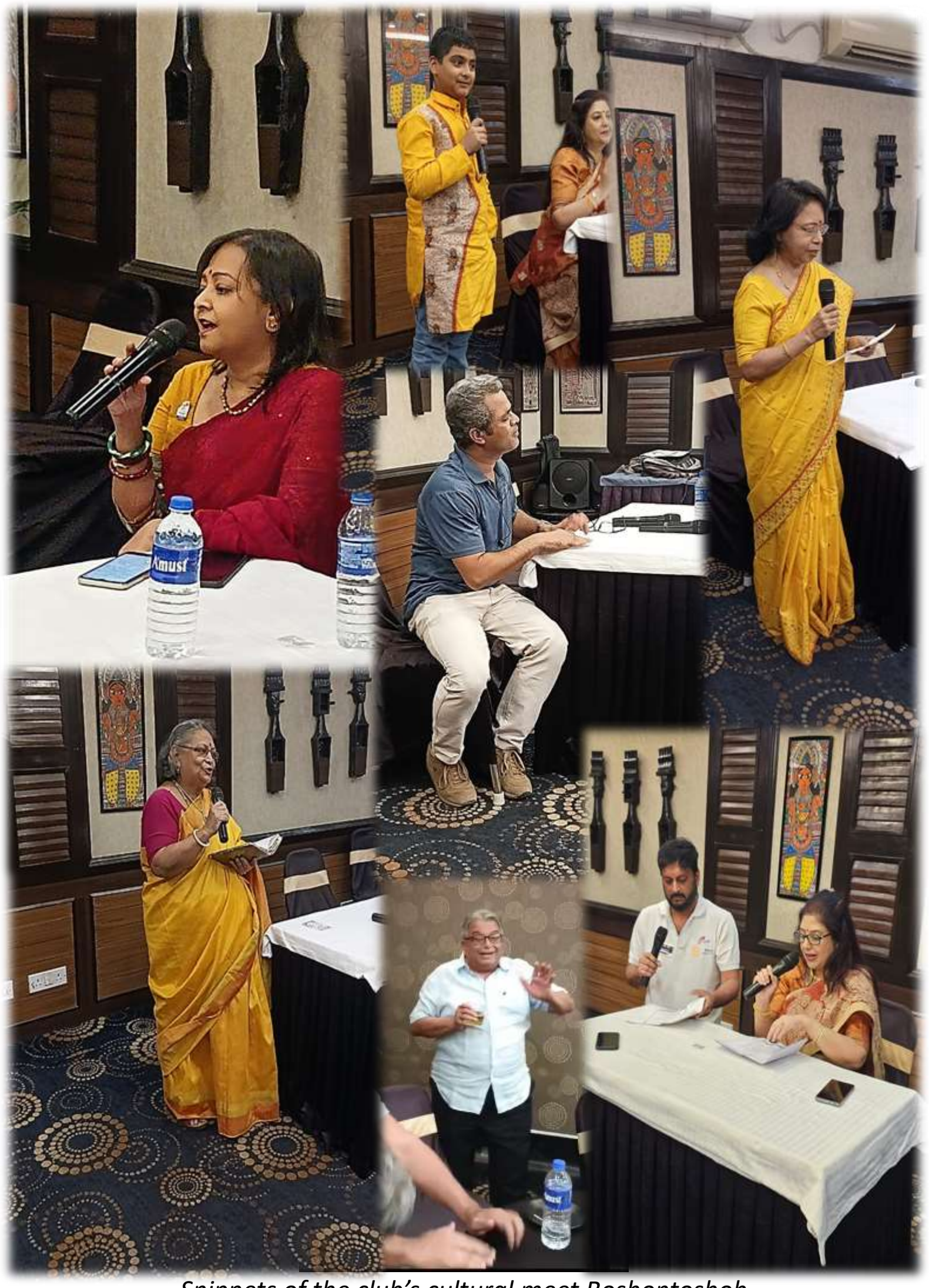
Snippets of the club's cultural meet Boshontoshob