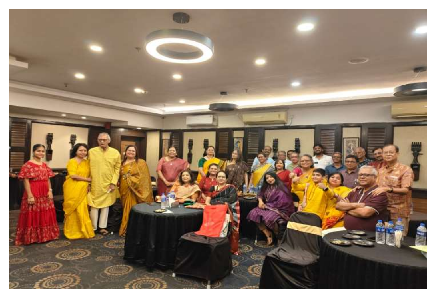
Induction of a new member